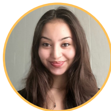
SOFIA CBS, Mexico